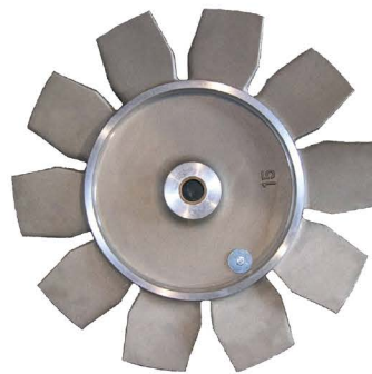
Cast Aluminum Axial Fan