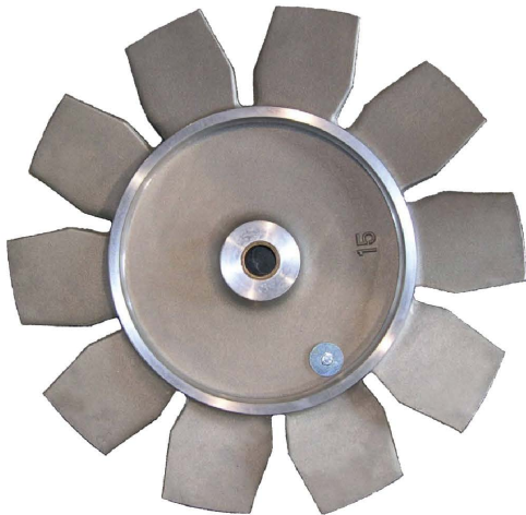
Cast Aluminum Axial Fan